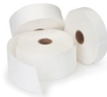
Lineco Tyvek tape 1”

Archival Tyvek® tape: Cover holes/slots on the outside of storage boxes that have holes/slots cut in to them during manufacturing (most storage boxes that are shipped flat) to keep out pests/dust/debris and to slow down smoke and water intrusion during a disaster. Apply over corrugated board edges (whether paper-based or polyethylene/polypropylene based) to keep pests/dust/debris out of the corrugation channels and to slow down smoke and water intrusion during a disaster. Burnish tape after applying using a blunt edge.