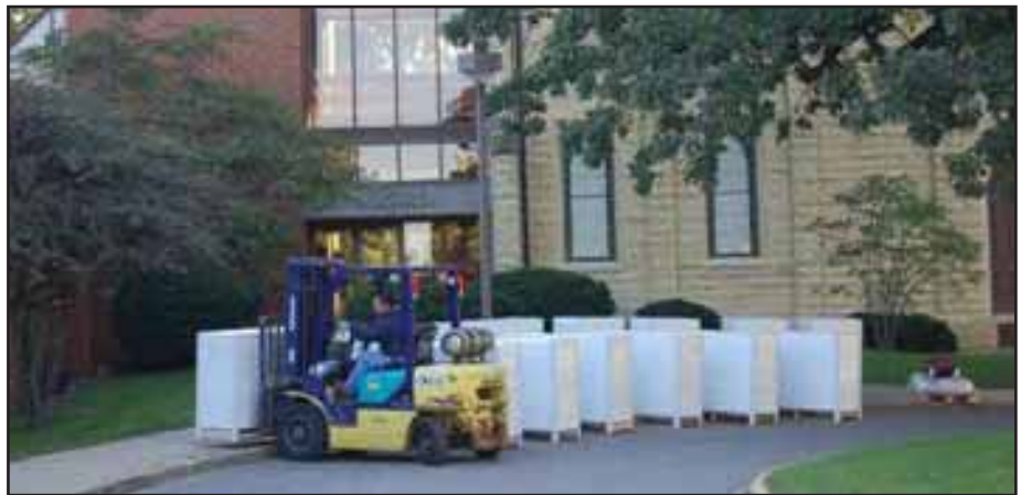
Delivery of fourteen archaeology cabinets from Delta Design, Inc.

During this process, accountability was important and objects were carefully tracked during the move. Box inventories were made in duplicate with one copy adhered to the box and one copy in a master binder. At the end of each workday, the database was updated from information in the master binder.